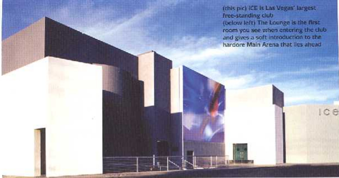
(this pic) ICE is Las Vegas' largest free-standing club (below left) The Lounge is the first room you see when entering the club and gives a soft introduction to the hardcore Main Arena that lies ahead